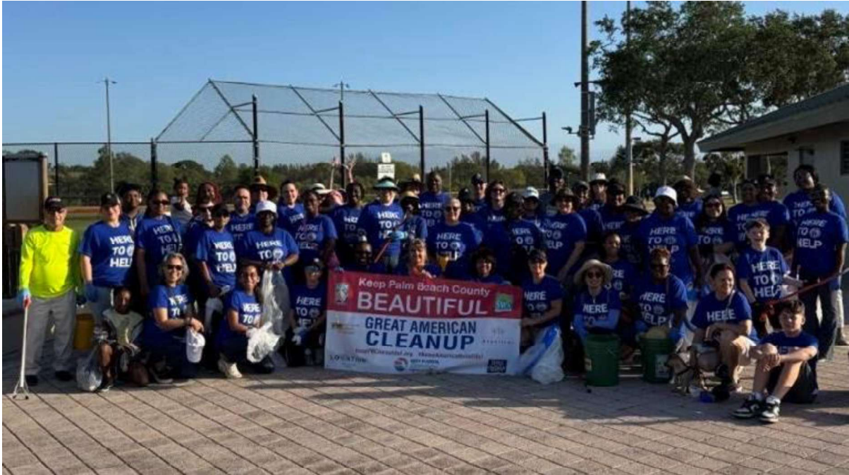
Clerk team members spent the morning of April 26 at Dyer Park in West Palm Beach collecting litter for the