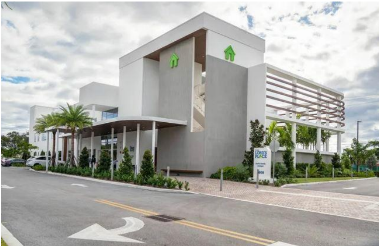
Staff recently attended the grand opening of The Lord's Place new Fortin Family Campus, a 25,000-square-foot client service center located in West Palm Beach.

They help house over 250 individuals every night, giving them a safe and stable place to call home.