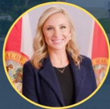
LAUREN BOOK Senate Democratic Leader