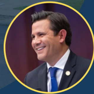
JASON PIZZO Senate Democratic Leader Pro Tempore