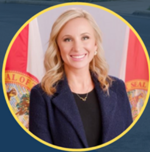
LAUREN BOOK Senate Democratic Leader