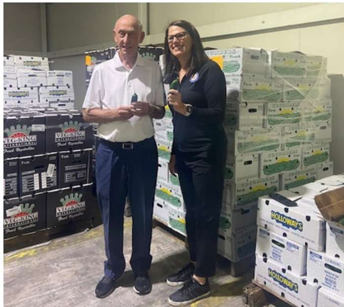
Tour of the Edward L. Myrick State Farmer's Market in Pompano Beach