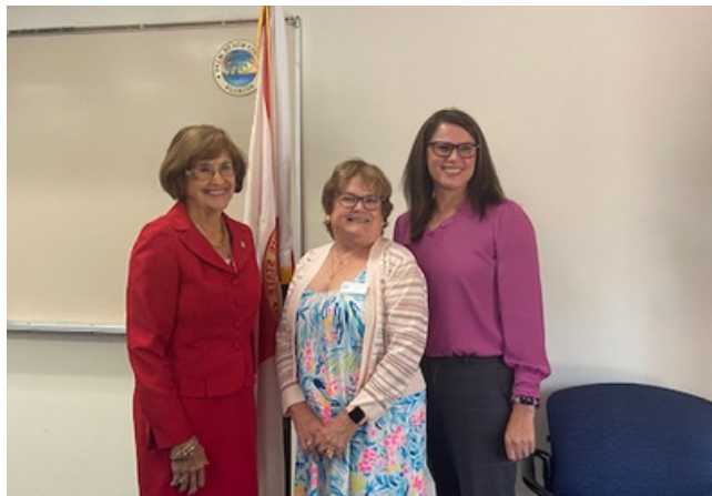
Legislative update with the Palm Beach County League of Women Voters