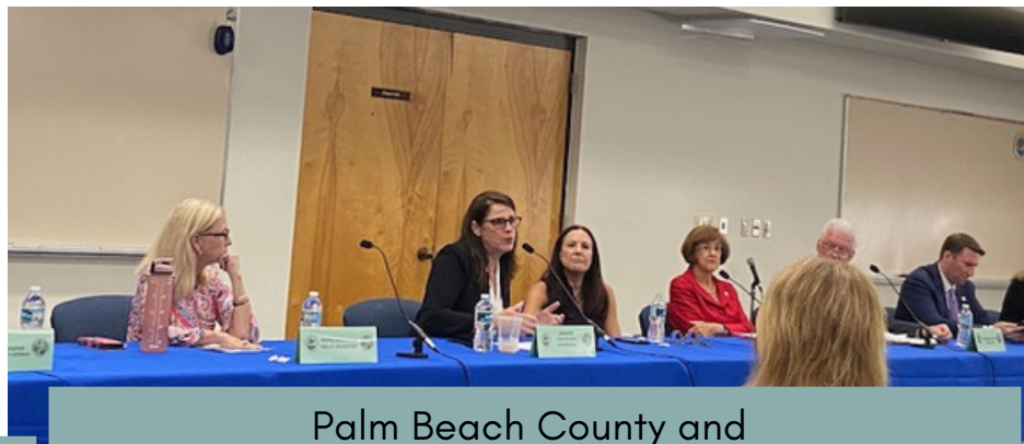
Palm Beach County and Economic Council Legislative update