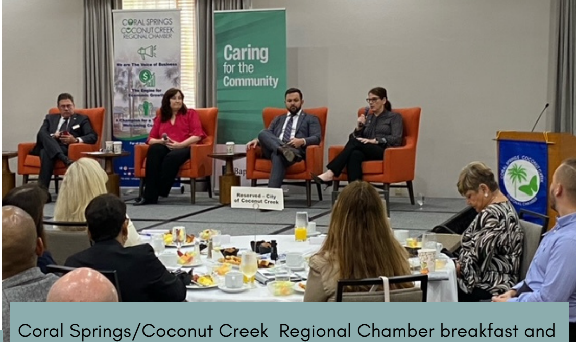
Coral Springs/Coconut Creek Regional Chamber breakfast and legislative update