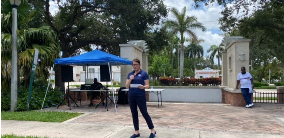
Recognizing Juneteenth at Hughes Park in Pearl City, Boca Raton.