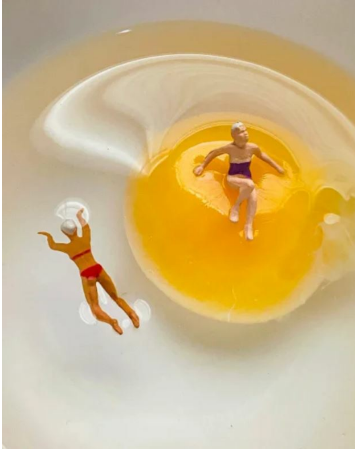
Isha Potharaju's digital photo "Yolk" is on display