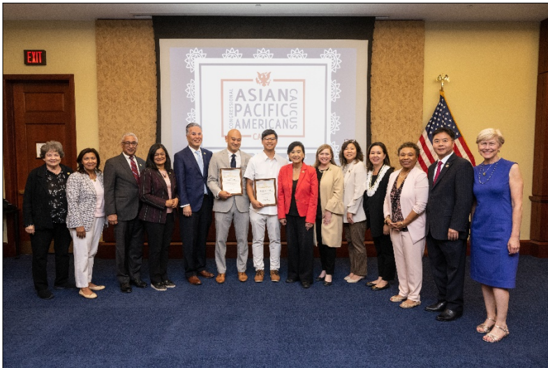
◀ Rep. Frankel celebrating Asian American and Pacific Islander Heritage Month with the Congressional Asian Pacific American Caucus.