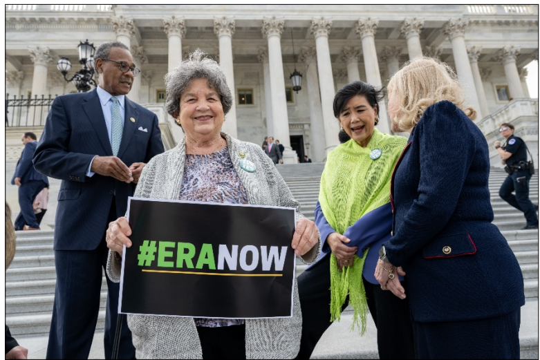
Rep. Frankel with the Equal Rights Amendment Caucus. ▶