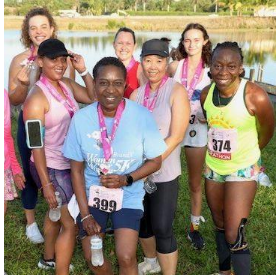
Women for Women 5K for Quantum House Saturday, May 13 Jupiter