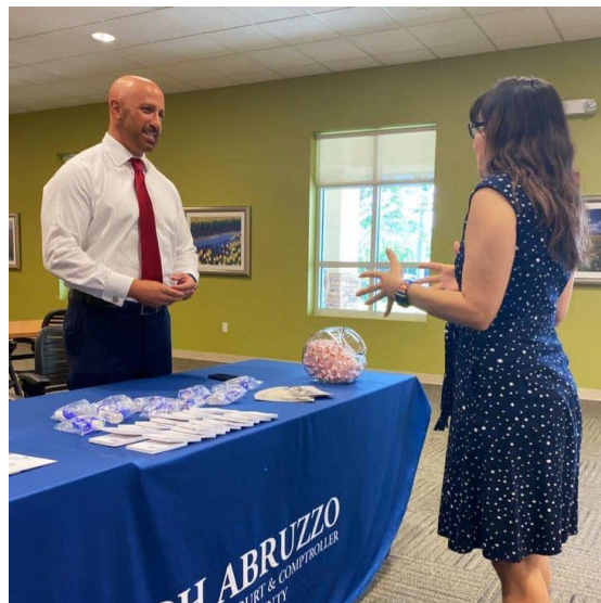
Acreage Branch Office Hours Wednesday, May 24 Loxahatchee