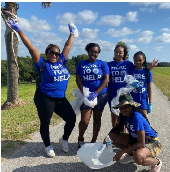
County Park Cleanup Saturday, May 13 Boca Raton