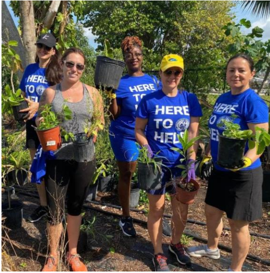
Greening at Westgate Community Farm Saturday, April 29 West Palm Beach