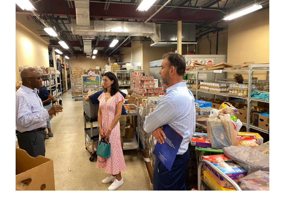
Touring BHH's food pantry