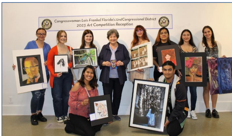
◀ Rep. Frankel with all participants of the 2023 Congressional Art Competition.