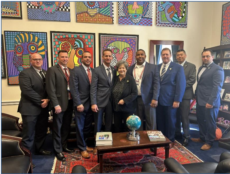
Rep. Frankel Meeting with Palm Beach County Firefighters