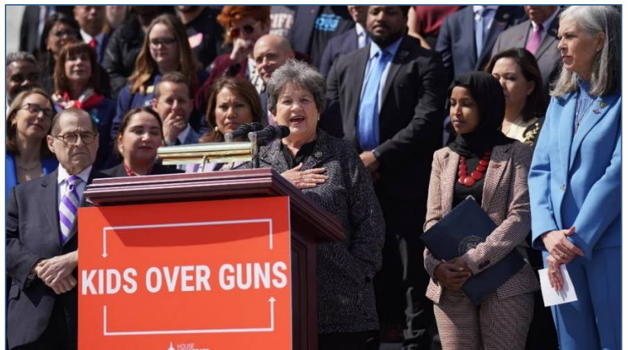
Rep. Frankel Joins Democratic Leadership in Calling for Commonsense Gun Legislation