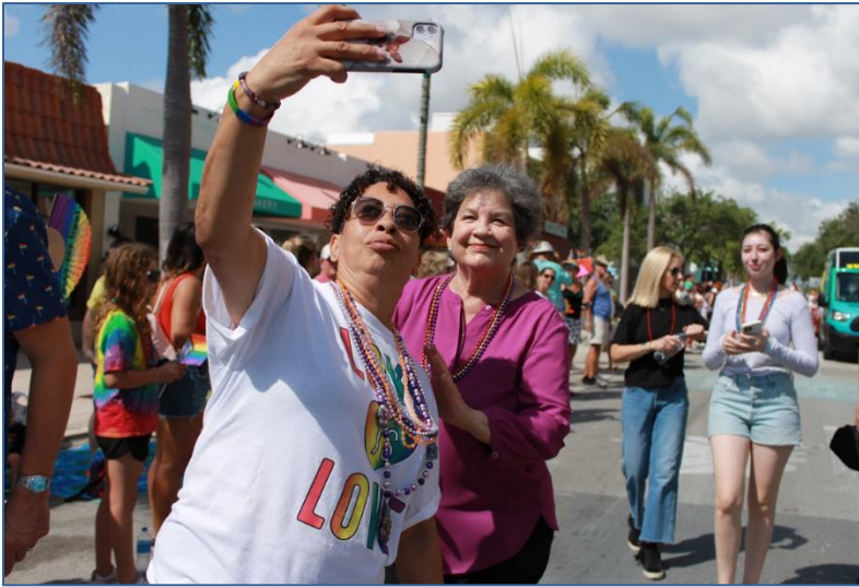
Rep. Frankel Celebrating 2023 Palm Beach Pride