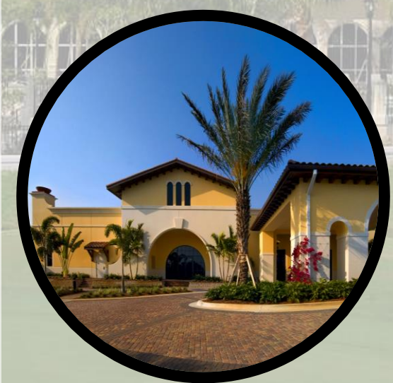
Pelican Preserve Country Club, Fort Myers