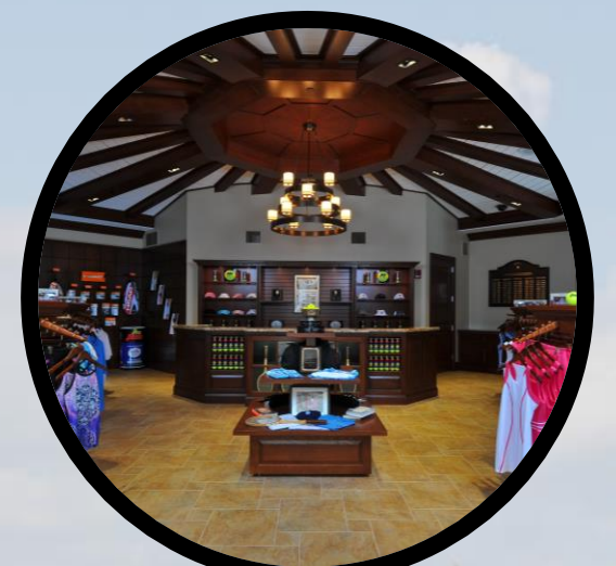
Aberdeen Golf & Country Club, Boynton Beach