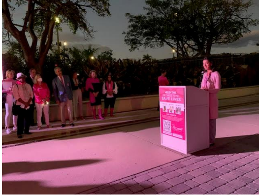
I participated in the Promise Fund of Florida's Annual Bridge Lighting & Pink Boots on the Ground Celebration at the Royal Park Bridge.

early detection and facilitates access to quality health care for those requiring diagnostics and treatment.