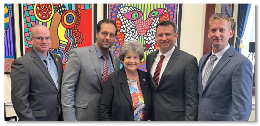
Meeting with Firefighters & Paramedics of Boca Raton, Local 1560