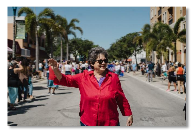
Palm Beach Pride Parade