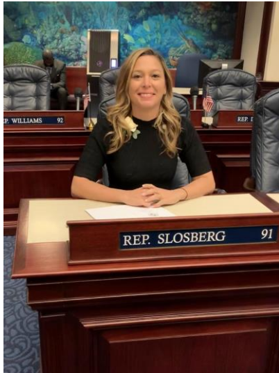
Rep. Emily Slosberg-King Florida District 91 House of Representatives