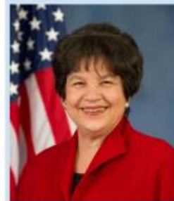
Congresswomen Lois Frankel