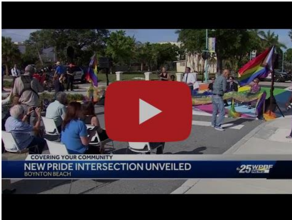
Unveiling of the Pride Intersection in Boynton Beach.