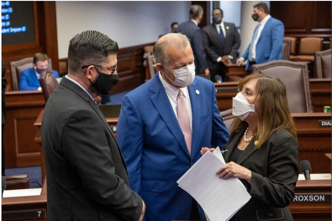
Senator Berman speaking with Senators Diaz and Broxson on the Senate Floor about energy policy and her bill, SB 188