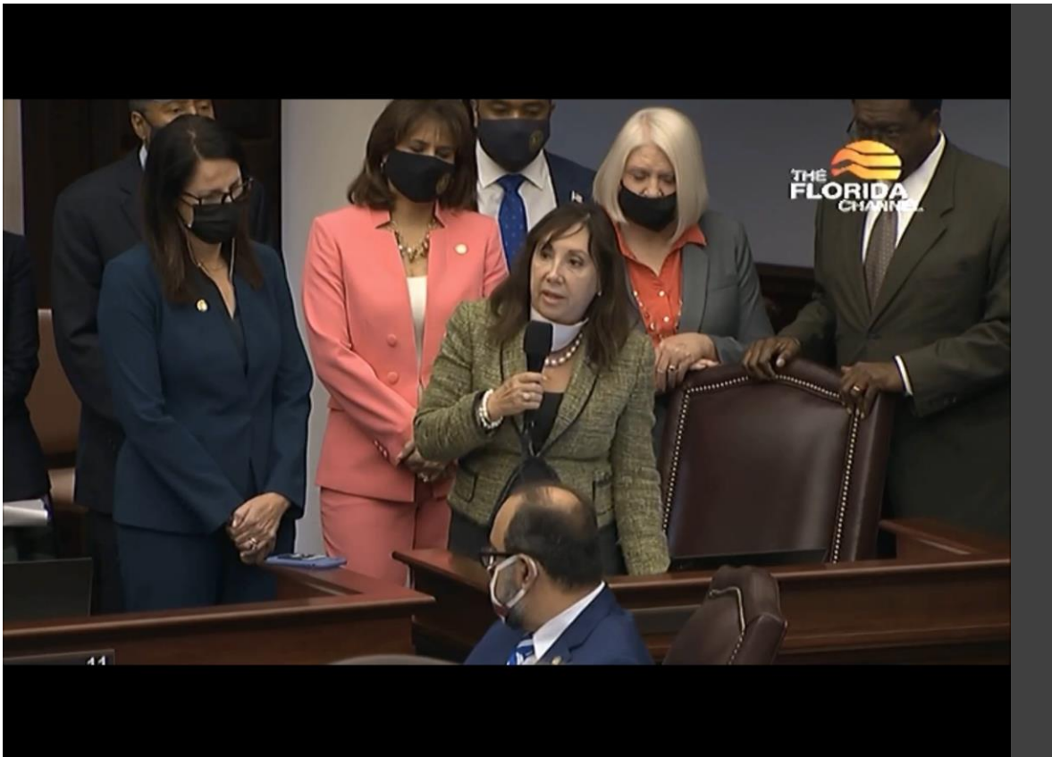
Video of Senator Berman leading the Florida Senate in a moment of silence for Yom HaShoah, Holocaust Remembrance Day.

expenditures by federal, state, regional, and local governments necessary to improve resilience to inland and coastal flooding on a 50-year planning period. SB 1954 will create the Resilient Florida Grant Program, authorizing the Department of Environmental Protection to provide grants to local governments to combat rising sea levels. A rising sea will have major impacts on Florida's real estate, valued at over $130 billion, on half of our beaches, and on substantial critical infrastructure. Resilience and adaptation are important, but without mitigation strategies, like lowering our greenhouse gas emissions, we'll have done nothing to address the root cause of our changing climate.