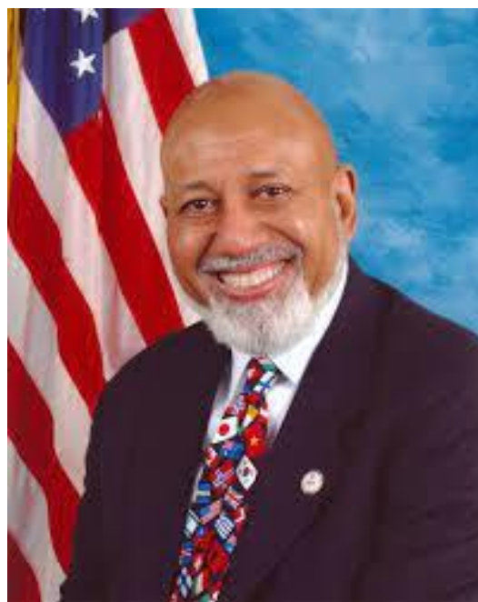
U.S. Congressman Alcee Hastings