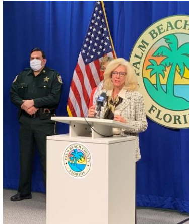
Commissioner Maria Sachs speaks at a press conference on Covid vaccine update