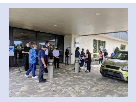
Kings Point Residents Arrive