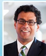
Atul Gawande, MD

Director, National Institute of Allergy & Infectious Diseases