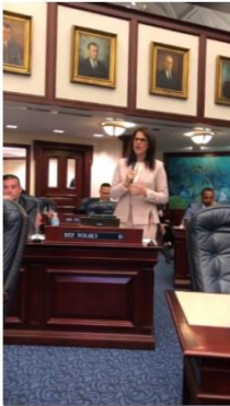
Representative Polsky fighting for union employees on the floor