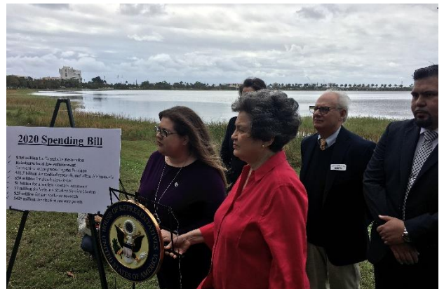
Rep. Frankel highlights bipartisan 2020 Funding Bill

As a member of the House Appropriations Committee, Rep. Frankel advocated for an array of programs that were included in the final legislation. The bipartisan deal includes robust funding for hard-working families through early learning programs, medical research and veteran's education. The funding also makes smart investments in our country's infrastructure, including restoration of Florida's Everglades to keep the drinking water for over eight million residents and millions of visitors clean and safe.