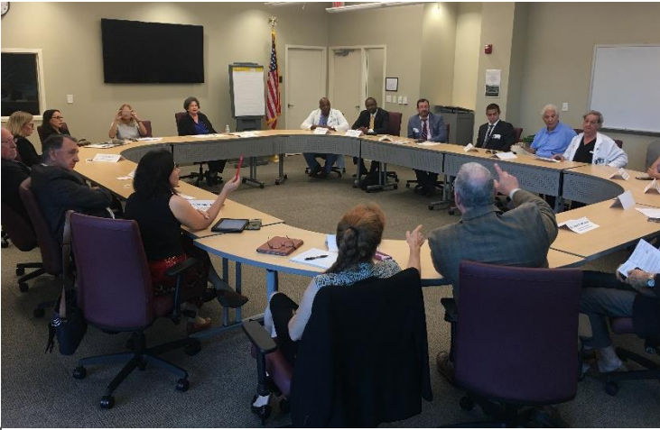
Rep. Frankel hosting a listening roundtable with local healthcare professionals from South Florida.

The Congresswoman hosted a listening roundtable with healthcare professionals from South Florida to hear about pressing issues facing physicians and patients.