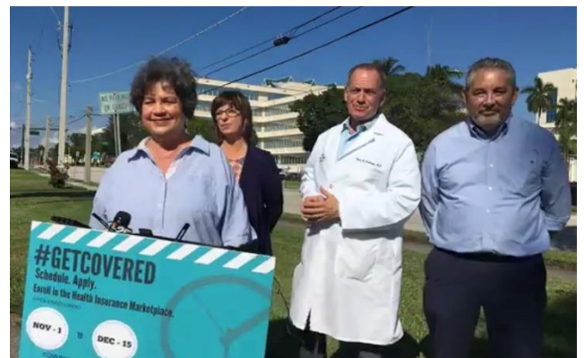
Rep. Frankel announces 2020 Affordable Care Act Open Enrollment period.

Congresswoman Frankel wants everyone to be reminded about the open enrollment period. Open enrollment for 2020 plans started on Friday, November 1 and goes through December 15. This marks the seventh year the Affordable Care Act will provide access to affordable healthcare in Florida for individuals and families in need of health plans. If you have questions or need help signing up for a plan, you can contact Epilepsy Florida at (727) 254-4962.