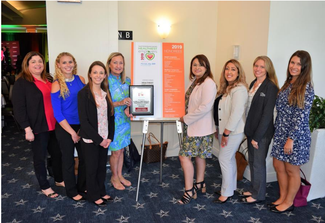
The Clerk's Human Resources team accepting the 2019 South Florida Business Journal Healthiest Employer award.

The Clerk & Comptroller's continued commitment to improving the physical, emotional and financial well-being of our nearly 700 employees earned us the second place spot on the South Florida Business Journal's healthiest employer list for 2019. This marks the sixth time since 2012 that our office has appeared on the healthiest employer list. Learn more.