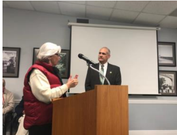
Town of Lantana