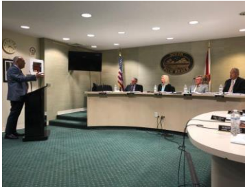
Town of South Palm Beach

District 4 is comprised of 12 municipalities: the cities of Boca Raton, Boynton Beach, and Delray Beach; the Village of Golf; and the towns of Briny Breezes, Gulfstream, Highland Beach, Hypoluxo, Lantana, Manalapan, Ocean Ridge, and South Palm Beach.