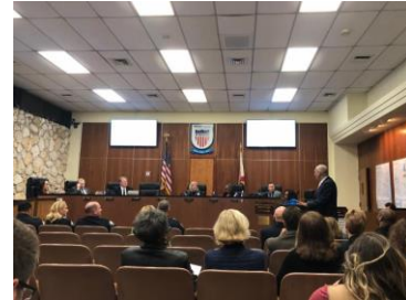
City of Delray Beach