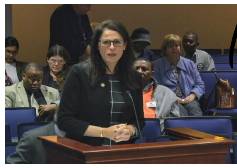
Rep. Polsky Presenting HB 671 in the Workforce Development Committee.